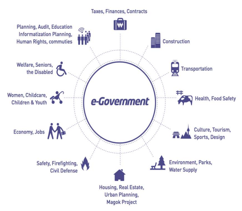
Figure 1-2. Seoul Metropolitan e-Government.

The role of Seoul Metropolitan Government is to organize information systems dealing with all city governments' public services, to establish telecom network connecting its 32 related organizations, and to arrange an extensive e-Government promotion group headed by the chief information officer (CIO).