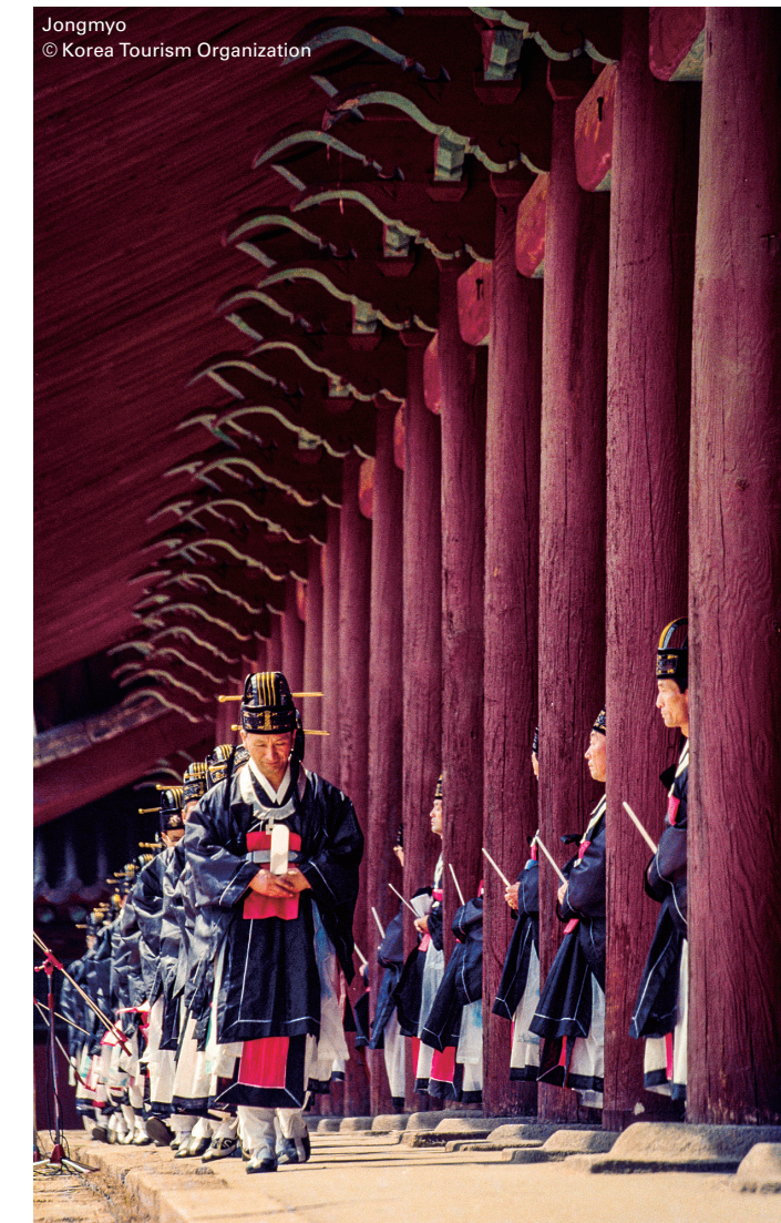
Jongmyo

Seoul has been the capital and center of Korean culture and history for over 600 years. Traces of the city's ancient legacy can be found everywhere from its Five Royal Palaces to the Seoul City Walls. Their careful preservation has earned sites like Changdeokgung Palace – often featured in popular Korean historical dramas – a place on the UNESCO World Heritage List. Today, Seoul is a culture trendsetter making impressions in music, fashion, and artistic creativity in Asia and beyond.