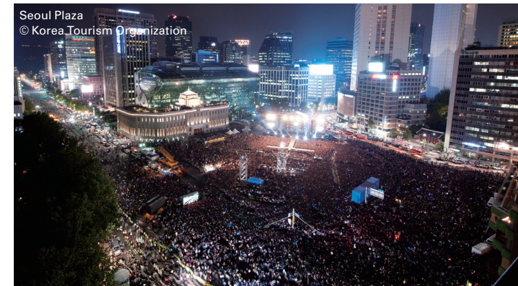
Seoul Plaza

Koreans are a fun-loving people and this is reflected in the number of festivals and celebrations occurring year-round in Seoul. Some 600 festivals take place annually in the city including the dazzling Seoul Lantern Festival and the energizing Hi Seoul Festival. It doesn't end there though as the Seoul International Fireworks Festival, the annual international b-boy tournament, R16 Korea, and the frequent events taking place at Seoul Plaza in front of City Hall helps keep the city lively.