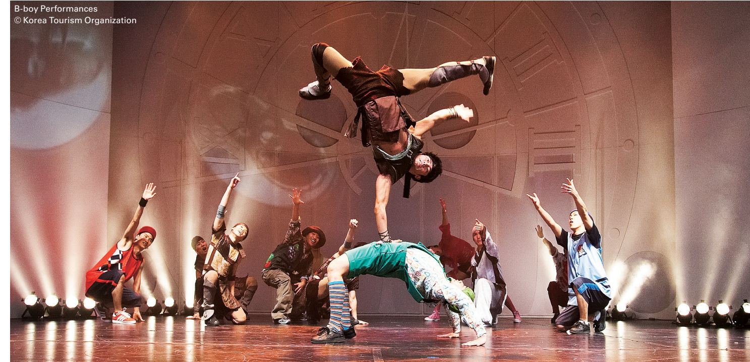
B-boy Performances