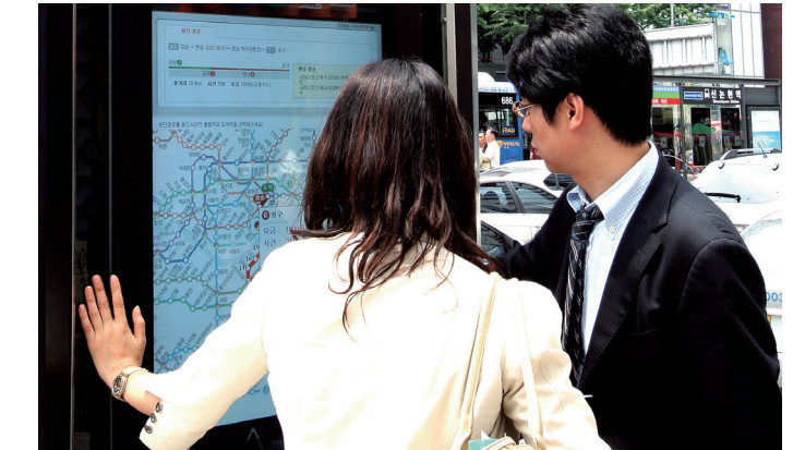
Coex

As a world leader in technology, Seoul is a city where high-speed communications enhance every aspect of modern life. Here, you'll experience some of the fastest internet speeds in the world, both wired and wireless, and the city-wide WiFi coverage means you can almost always be connected online from anywhere in the city, 24 hours a day. And with Seoul's major meeting venues like the Coex Convention and Exhibition Center making full use of the latest technology, you'll easily see why Seoul is truly a "smart" city.