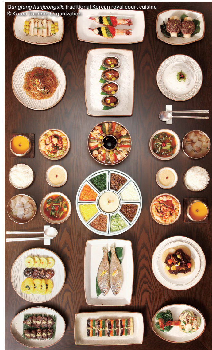
Gungjung hanjeongsik, traditional Korean royal court cuisine

Visitors to Seoul often leave with glowing mentions about their Korean culinary experiences. In addition to common favorites such as kimchi , galbi (marinated ribs), bibimbap (rice topped with sautéed vegetables and other toppings), you can find a long list of restaurants specializing in the diverse cuisine of Korea's different regions. Of course, the variety of global cuisine offered here is just as astounding whether you're looking for authentic Italian, Middle Eastern, or Indian just to name a few.