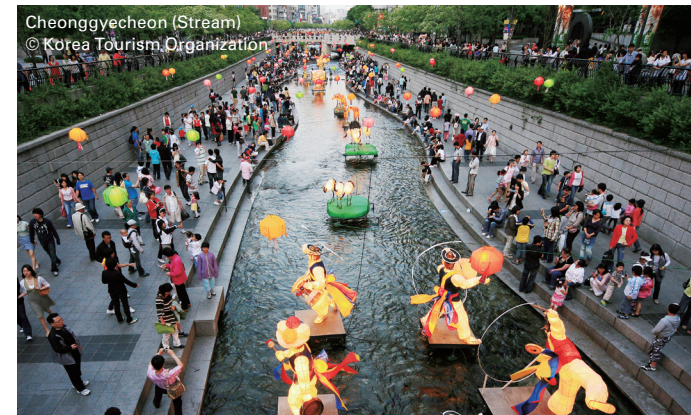
Cheonggyecheon (Stream)

Seoul is graced by the Hangang River that flows through the center of the city as well as majestic mountains like Bukhansan National Park and Mt. Namsan in, and around, the capital. Public parks of all types and sizes, such as the Seoul Olympic Park, are found scattered throughout the city with open access to both locals and visitors. Additionally, the city is intensifying its green efforts with a constantly increasing number of bicycle and walking trails and major eco-friendly projects such as the restoration of the Cheonggyecheon Stream in the center of Seoul.